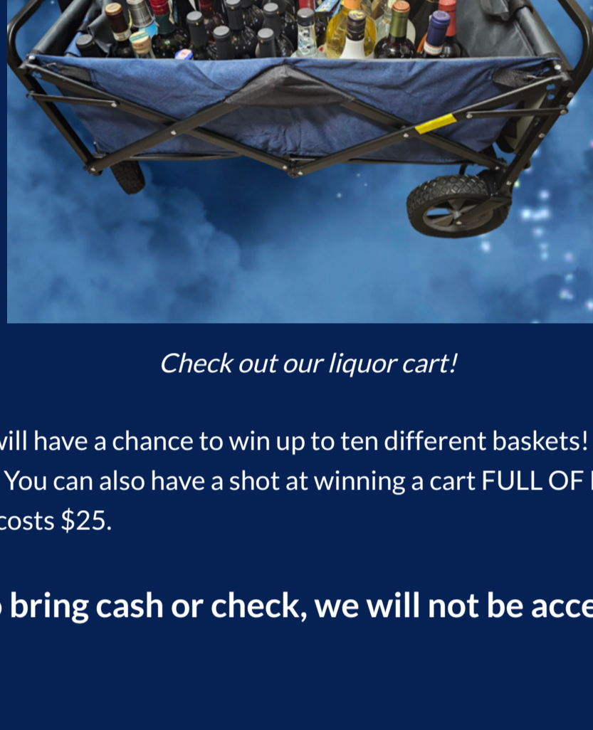
Check out our liquor cart!

At the gala, you will have a chance to win up to ten different baskets! A basket ticket is $10 or 5 for $40. You can also have a shot at winning a cart FULL OF LIQUOR! Each raffle cart ticket costs $25.