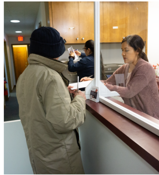
On January 24th, an HACES client received a COVID relief stipend through the Immigrant Family Support Program (IFSP).

Between January 1 and December 31, 2023: HACES Immigration Case Workers helped 214 individuals submit applications for asylum.